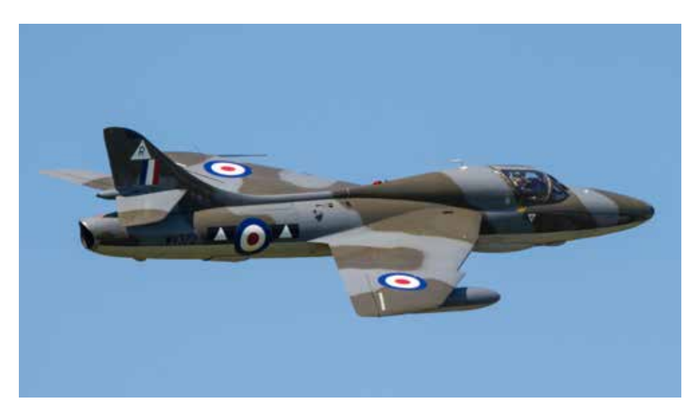
Figure 3 Hawker Hunter G-BXFI during the initial 'fly past'.

The Hawker Hunter T7 is a single-engine advanced military jet trainer capable of speeds close to the speed of sound. G-BXFI was built in 1955 as a single-seat aircraft, but subsequently it was modified to a two-seat trainer in 1959<sup>4</sup>. Both pilot positions were fitted with ejection seats. It remained in military service until 1997, when it was transferred to the civilian register. Figure 3 shows the aircraft during the 'fly past' at the commencement of the display.