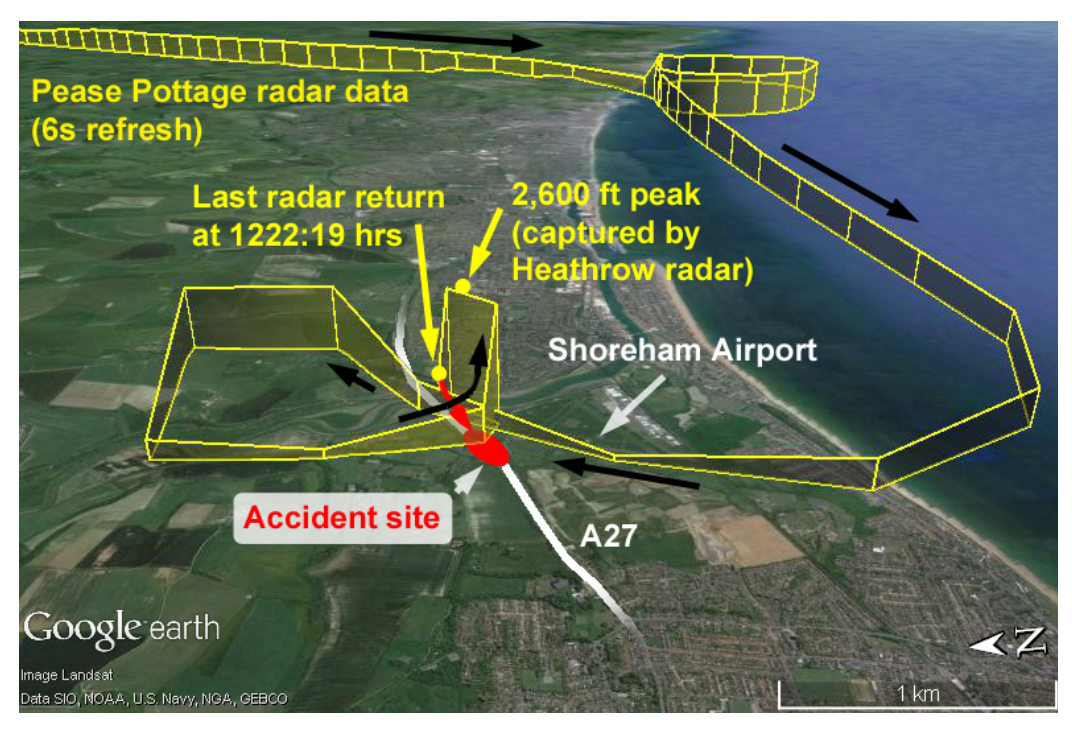
Figure 1 Approximate flight path derived from Pease Pottage radar data

Having rolled upright and wings level, the descent was continued to 800 ft amsl and a right turn made to line up with the display line to the west of Runway 02/20 at Shoreham (see Figure 1). The aircraft remained in a gentle right turn with the angle of bank decreasing as it descended to 100 ft amsl and flew along the display line. It commenced a gentle climbing right turn to 1,600 ft amsl, executing a Derry turn<sup>2</sup> to the left and then commenced a descending left turn to 200 ft amsl, approaching the display line at an angle of about 45°. The aircraft then pitched up into a manoeuvre with both a vertical component and roll to the left, becoming almost fully inverted at the apex of the manoeuvre at a height of approximately 2,600 ft amsl. During the descent the aircraft accelerated and the nose was raised but the aircraft did not achieve level flight before it struck the westbound carriageway of the A27 at its junction with Old Shoreham Road.